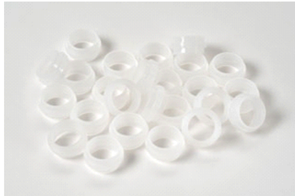
INJ-608 Collars for Water Injectors & Stealth Systems (25 Pack)