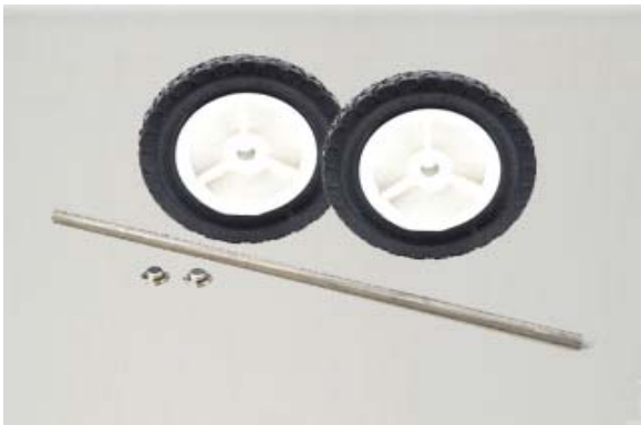
INJ-677 Wheel Kit for INJ-MINI, CRT-12V & FLT-DC12 carts