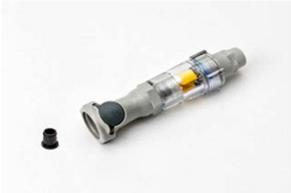
FLT-071 Replacement Front End for Stealth Water Supplies