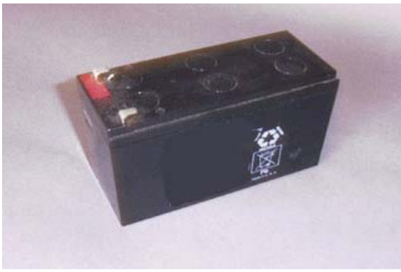
CRT-095 Battery, 12 VDC