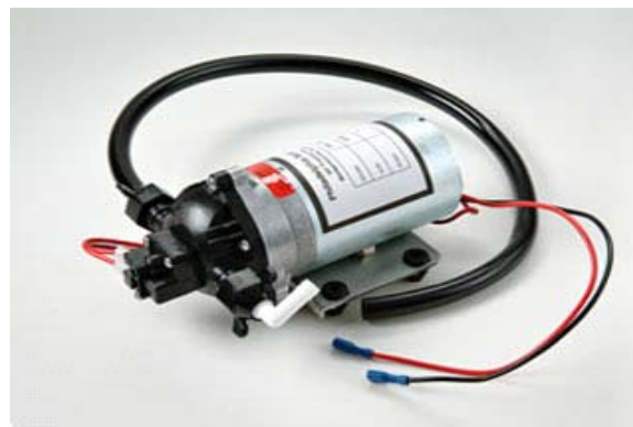
CRT-040 Pump, 12 VDC, with Clamps and Elbows