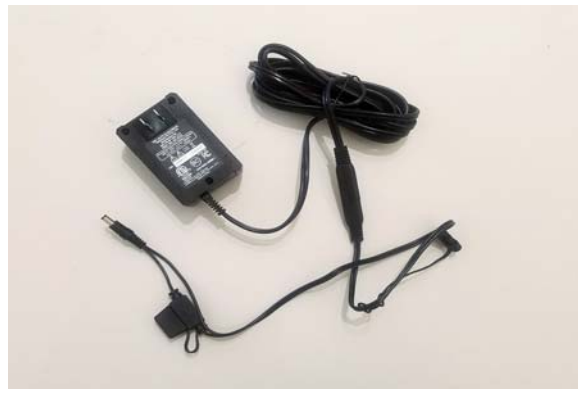
CRT-149 Charger, 120VAC to 12 VDC for CRT-12V & FLT-DC12 (Barrel Type) Serial# above 20062416