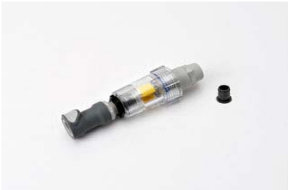
FLT-071E Replacement Front End for Stealth Water Supplies (BWT™ compatible)