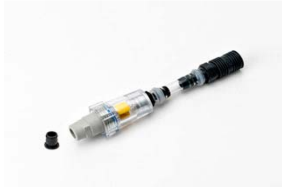
FLT-071A Replacement Front End for Stealth Water Supplies (BFS™ compatible)