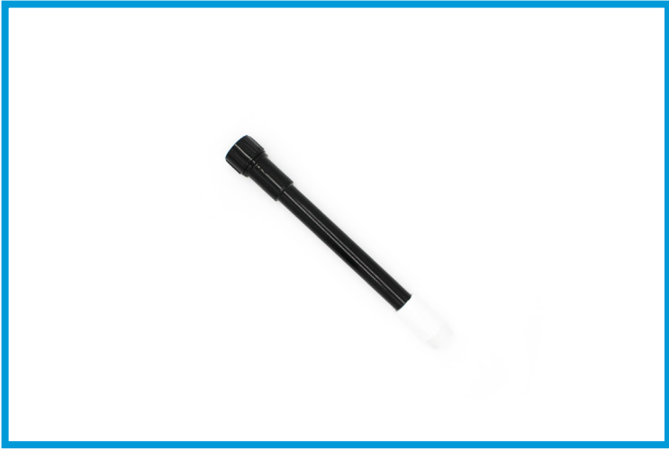
GUN-E9 - EXTENSION 9" Gun-X Body Extension

GUN-X THE WORLD'S BEST SELLING BATTERY WATERING GUN