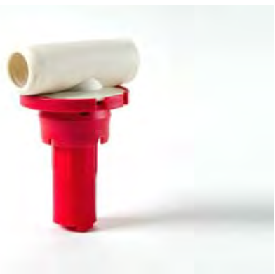
INJ-L1 Water Injector, for Standard Bayonet Vent Openings