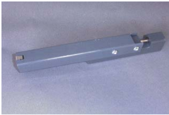
INJ-311 Injector Tubing Punch