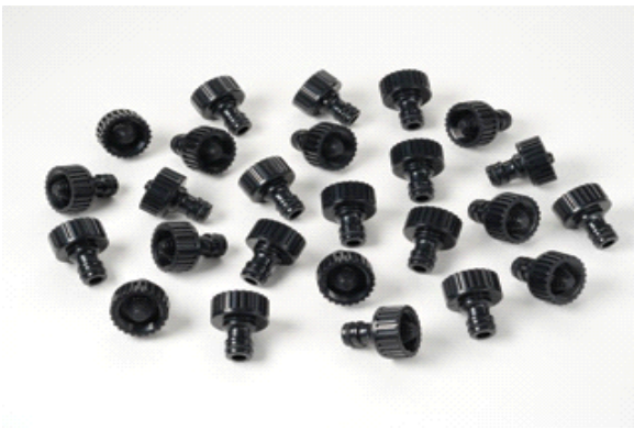
INJ-630 Quick-Connect MxF Thread with Check Valve (25 pack)