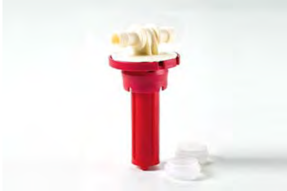
INJ-CL1A ClampLock Water Injector, Extended Downtube, for Standard Bayonet Vent Openings