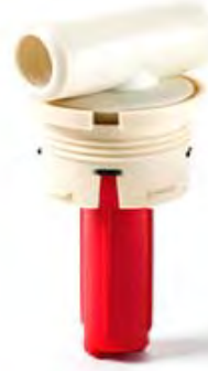
INJ-L1AD Water Injector, Extended Downtube, for DIN Vent Openings