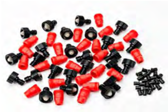
INJ-CP25 Quick-Connect Input Coupling for Water Injectors™ (25 pack)