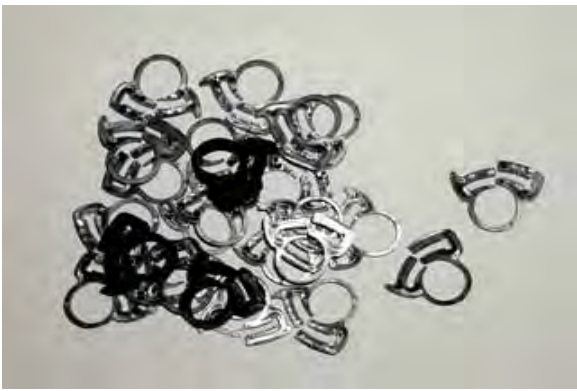
INJ-212 Ratchet Clamps (25 pack)