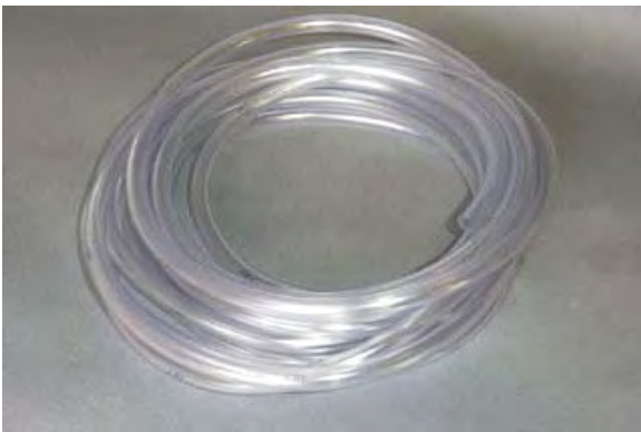
INJ-198 Tubing, 25 feet 1/2" OD