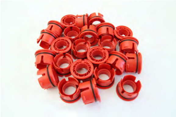
INJ-458 DIN Vent Adapter 24 pack