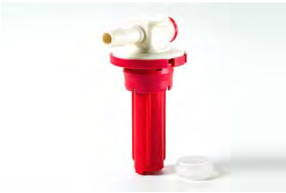
INJ-TL1A Terminating Water Injector, Extended Downtube, for Standard Bayonet Vent Openings