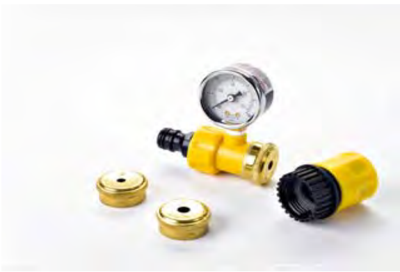
INJ-FC Flow Checker, for testing output pressure compatibility