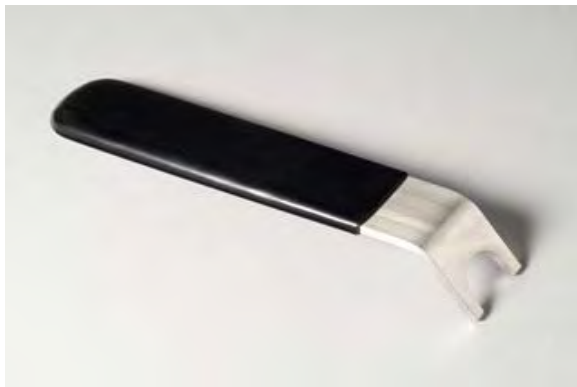
INJ-601 Collar Installation Tool