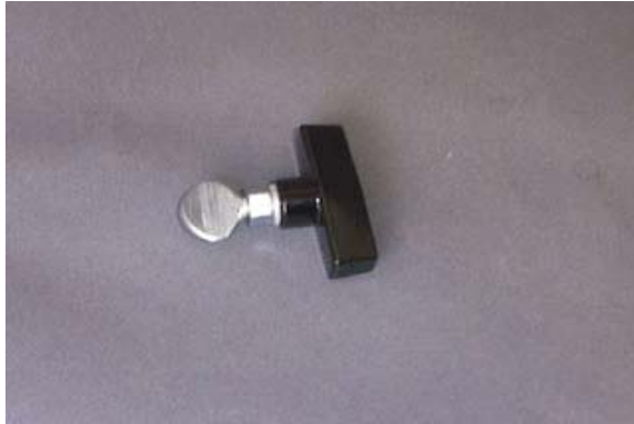
INJ-WR Quarter Turn Wrench