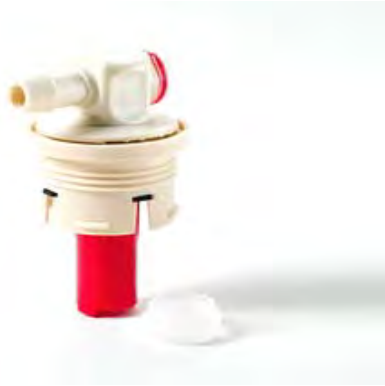
INJ-TL1D Terminating Water Injector, for DIN Vent Openings