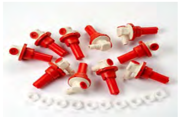
INJ-TL10 Terminating Injector, 10 pack, with collars