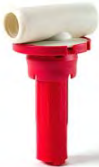
INJ-L1A Water Injector, Extended Downtube, for Standard Bayonet Vent Openings