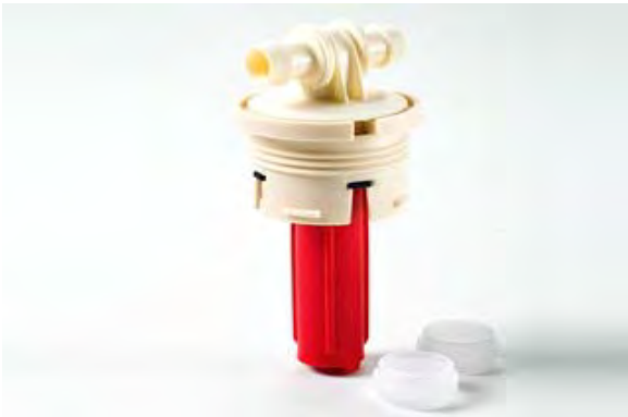
INJ-CL1AD ClampLock Water Injector, Extended Downtube, for DIN Vent Openings