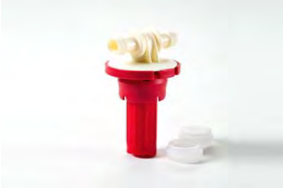
INJ-CL1 ClampLock Water Injector, for Standard Bayonet Vent Openings