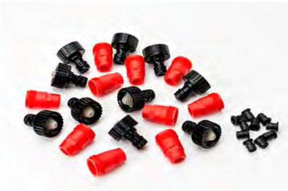
INJ-CP10 Quick-Connect Input Coupling for Water Injectors™ (10 pack)