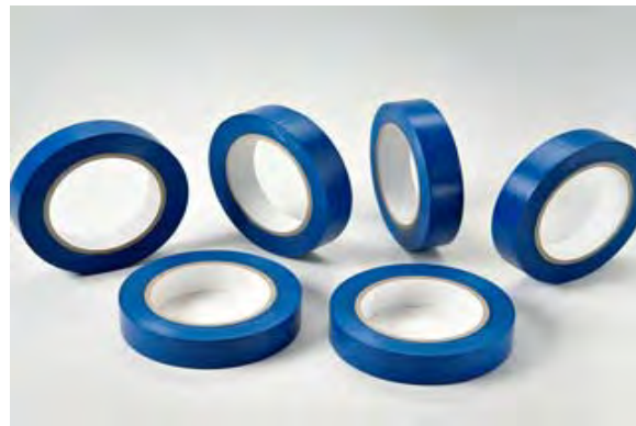
INJ-202 Tape, installation, 36 yd, (6 pack)