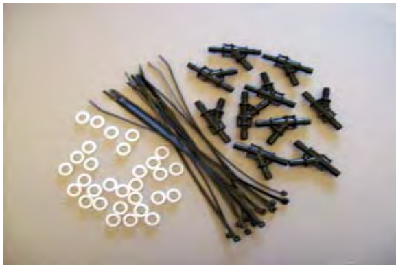
INJ-615 Wye Fitting with collars (10 Pack)