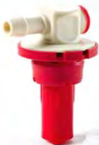
INJ-TL1 Terminating Water Injector, for Standard Bayonet Vent Openings