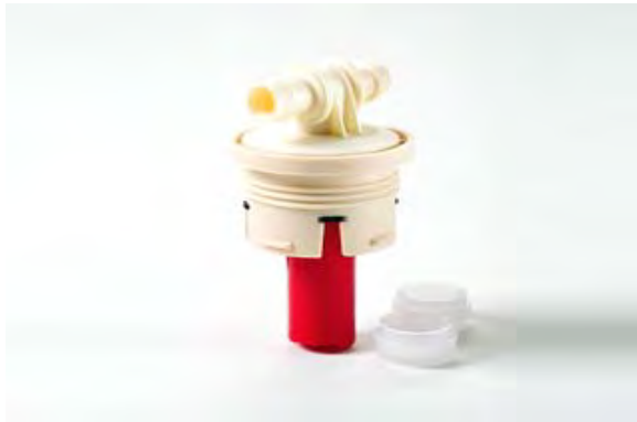
INJ-CL1D ClampLock Water Injector, for DIN Vent Openings