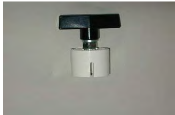
INJ-RWR Quarter Turn Wrench for Raised Adapters