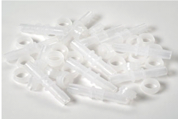
INJ-465 Repair Coupling with Collars (12 pack)