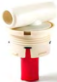
INJ-L1D Water Injector, for DIN Vent Openings