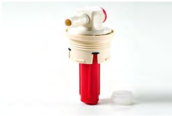
INJ-TL1AD Terminating Water Injector, Extended Downtube, for DIN Vent Openings