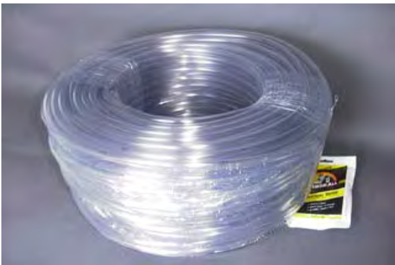
INJ-495 Injector Tubing, 375 feet, 1/2" OD