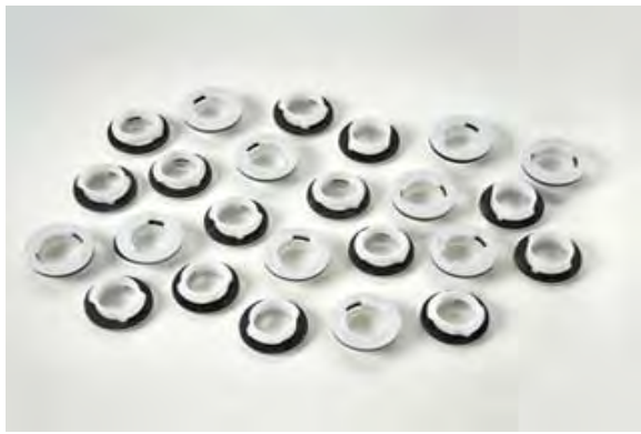
INJ-656 Quarter turn vent adapter (24 pack)