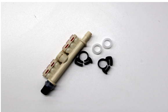
INJ-670 6 Port Inline Manifold for Injector Spider Systems