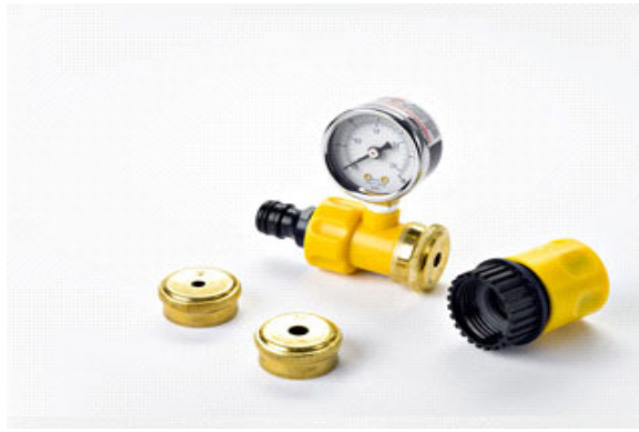
INJ-FC Flow Checker, for testing output pressure compatibility