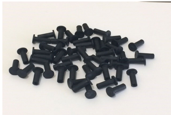
FLT-029 End Plug, Stealth Watering System - 50 pack