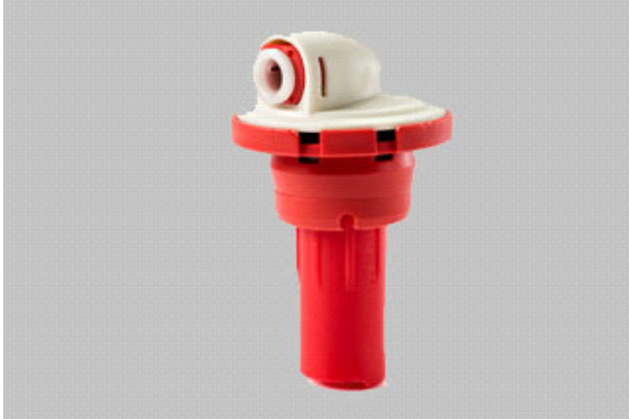
INJ-LP1 Injector Spider, Loose