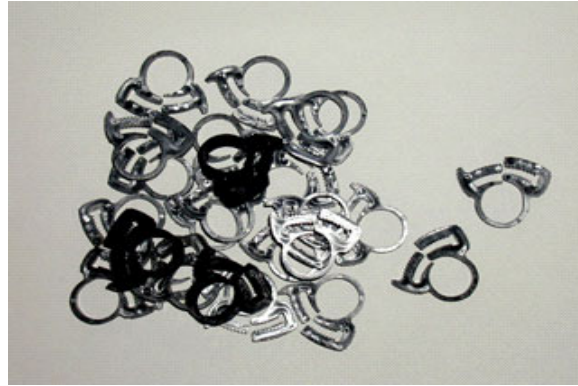
INJ-212 Ratchet Clamps (25 pack)