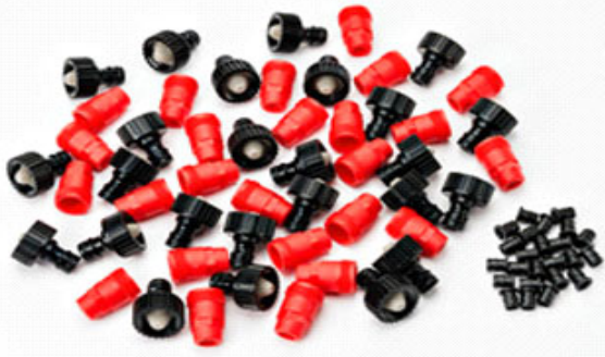
INJ-CP25 Quick-Connect Input Coupling for Water Injectors™ (25 pack)