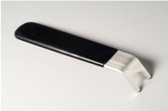
INJ-601 Collar Installation Tool