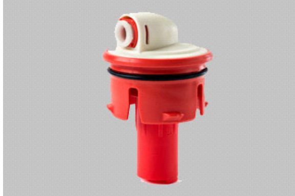
INJ-LP1D Water Injector Spider, for DIN Vent Openings