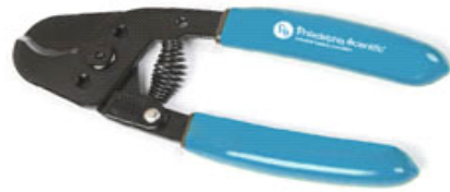
FLT-093 Tubing Cutter for Speed Tubing (Water Injector Spider & Stealth Watering Systems)