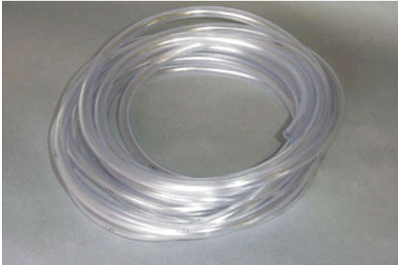
INJ-198 Tubing, 25 feet 1/2" OD