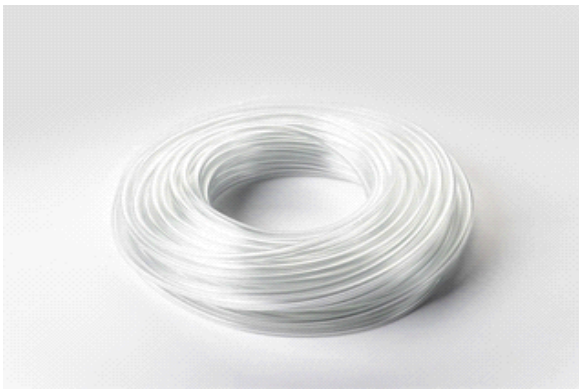
FLT-072 1/4" OD Tubing for Push-fit grippers for Stealth & Spider Systems