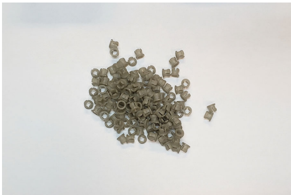
ACC-071 Grippers, Stealth Water Injector Spider, 100pk