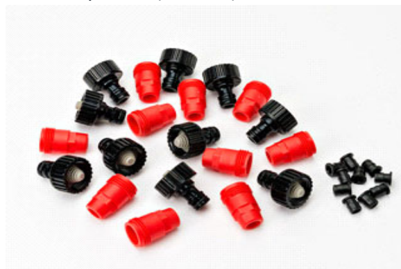
INJ-CP10 Quick-Connect Input Coupling for Water Injectors™ (10 pack)